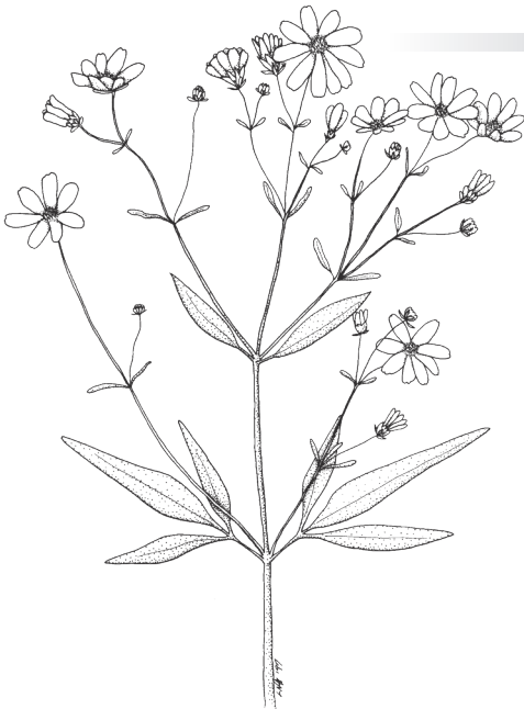
Coreopsis tripteris Tall Coreopsis

Proceeds from our Plant & Flower Sale are used to raise funds for Friends of the DuPage County Fair to help enhance and improve the grounds.